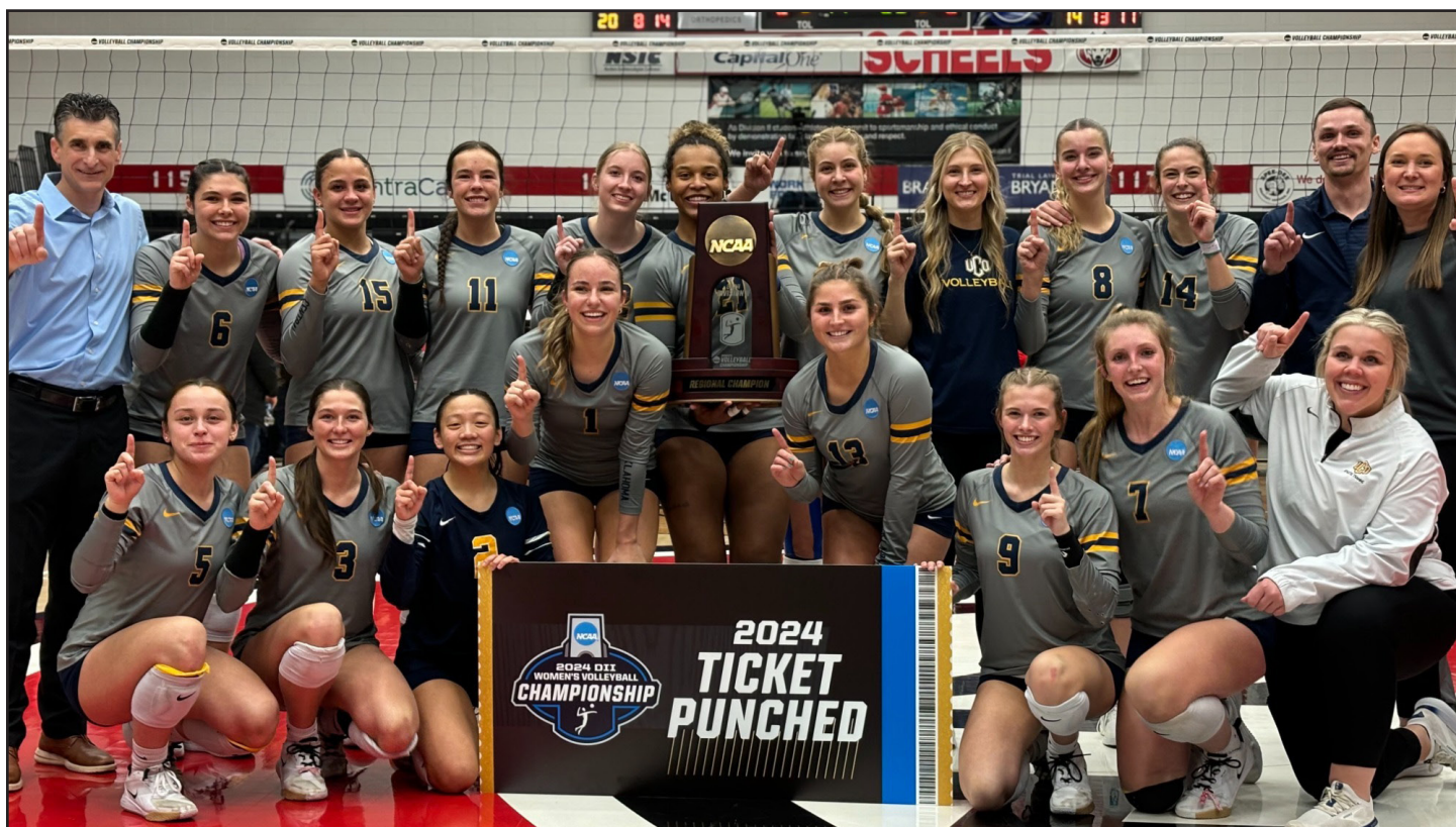
UCO's 2024 Central Regional Championship Team

High School: Four-year standout at Piedmont High School ... Team captain as a senior and earned All-State honors ... Helped lead Oklahoma Peak club team to national championship this summer.