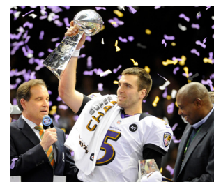
joe flacco '08