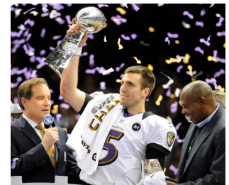
joe flacco '08