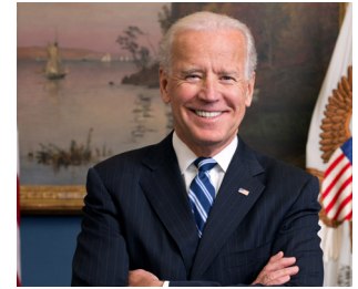
joe Biden '65