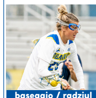
baseggio / radziul