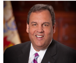
chris christie '84