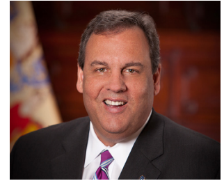
chris christie '84