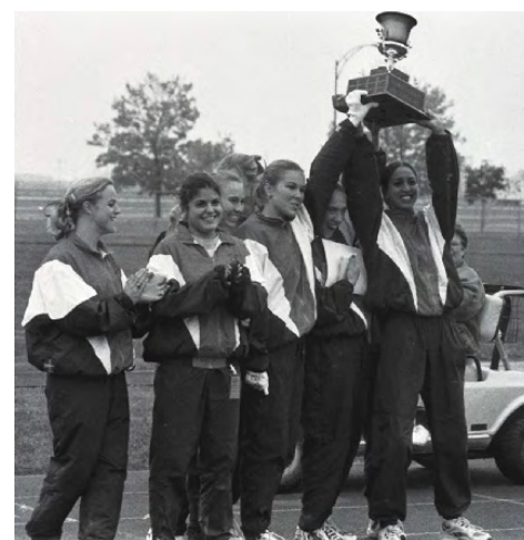
1998 MAC Champions