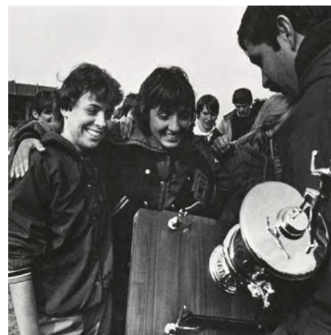
1982 MAC Champions