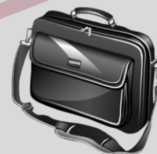
Computer bags/ briefcases