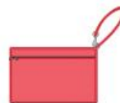
Small clutch bag, wristlet, or handheld wallet