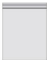
One-gallon sized clear plastic zip bag