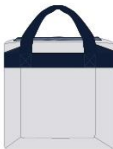
Clear plastic bag