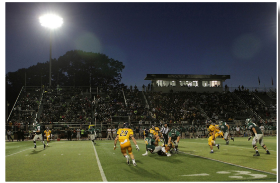
"Under the Lights" Night Football at Hameline Field Became a Reality in 2013