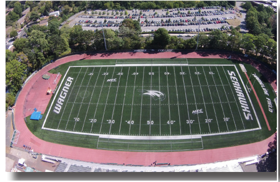
A brand new FieldTurf playing surface was installed at Hameline Field in the summer of 2016