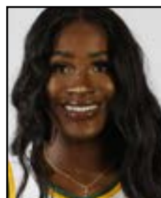
4 · QUEEN EGBO