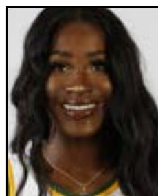
4 · QUEEN EGBO