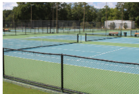
AUM Tennis Complex