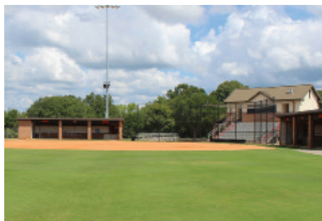
AUM Softball Complex