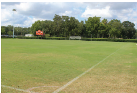
AUM Soccer Complex

Cost: $500 for one year / $1,200 for three years