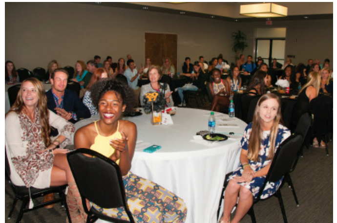
Warhawks' Choice Awards