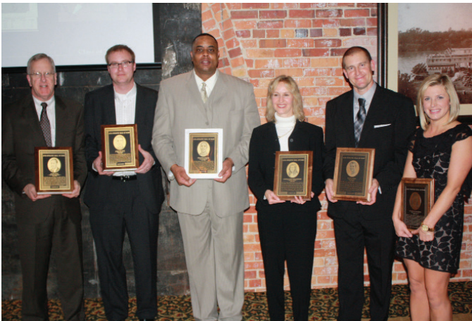
Hall of Fame Induction Ceremony