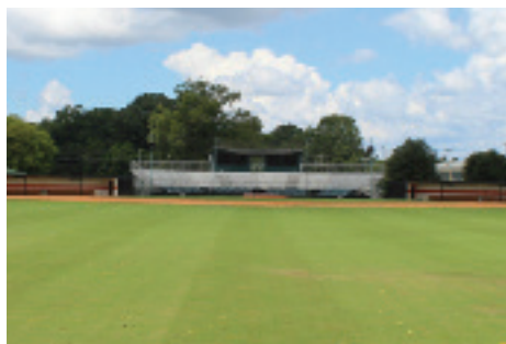
AUM Baseball Complex