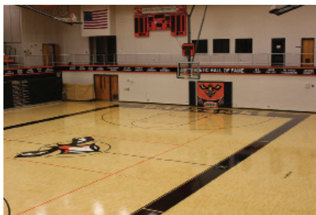
AUM Athletics Complex