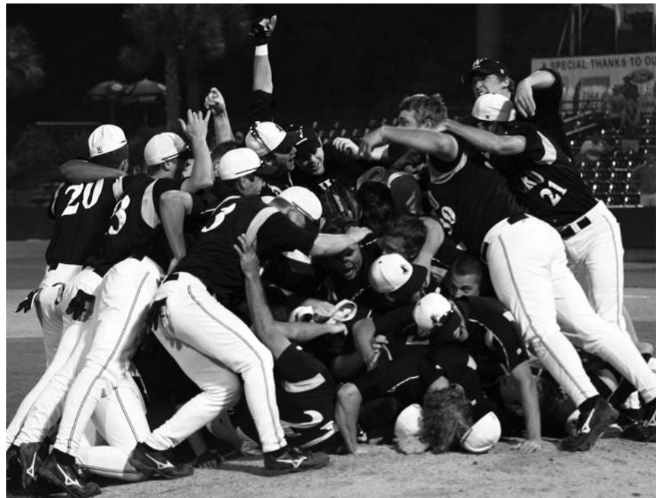
The 2007 team celebrates the Southern Conference Championship.