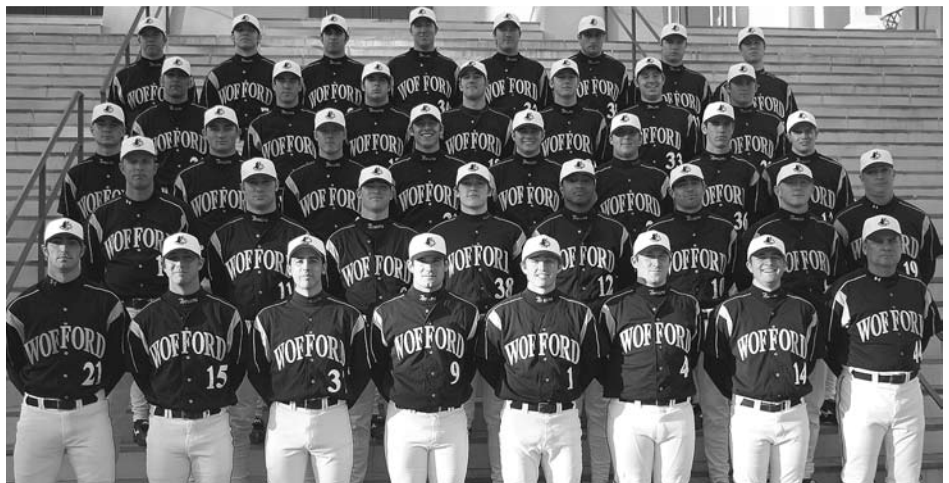
The 2007 team set thirteen team records, including hits, home runs and total bases.