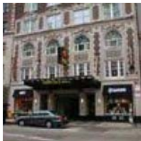
Comfort Inn and Suites Downtown 15 East Ohio Chicago, Illinois 60611 Phone: (312) 494-1515