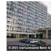
Crowne Plaza-O'Hare 5440 N. River Road Rosemont, IL 60018 Phone: (847) 671-6350