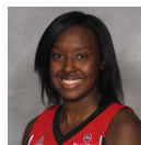
Brown-Haywood 3 - Senior