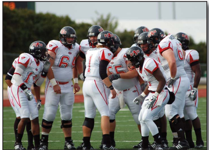
The Red Wolves offense scored in all four quarters against North Texas, extending its streak of consecutive quarters with a score to 11 in a row.