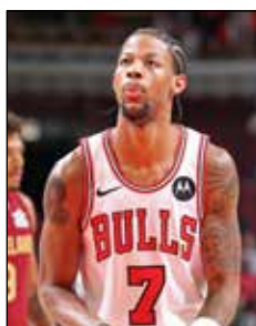
Dalen Terry Chicago Bulls 4th NBA season