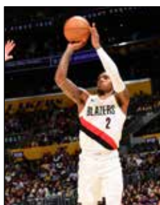
Caleb Love Portland Trail Blazers 1st NBA season