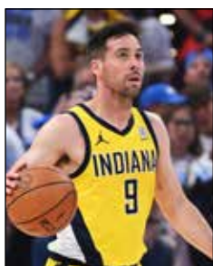
T.J. McConnell Indiana Pacers 11th NBA season