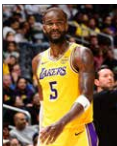
Deandre Ayton Los Angeles Lakers 8th NBA season