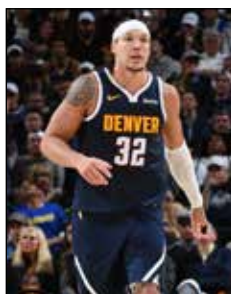
Aaron Gordon Denver Nuggets 12th NBA season