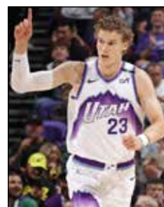
Lauri Markkanen Utah Jazz 9th NBA season