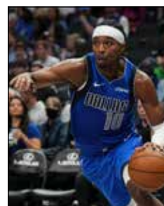
Brandon Williams Dallas Mavericks 4th NBA season