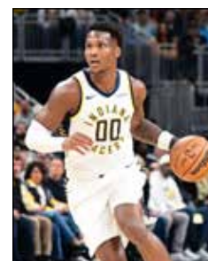
Bennedict Mathurin Indiana Pacers 4th NBA season