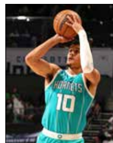
Josh Green Charlotte Hornets 6th NBA season