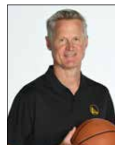
Steve Kerr Golden State Warriors 12th NBA season as Head Coach