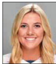
#25 EK Uithoven D - So.