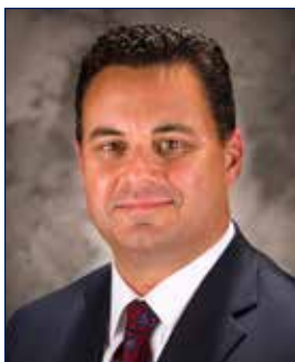
SEAN MILLER Head Coach 11th Season