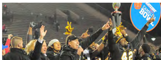
Making its FBS postseason debut, App State kicked a 23-yard FG as time expired in a 31-29 win against Ohio in the Camellia Bowl.