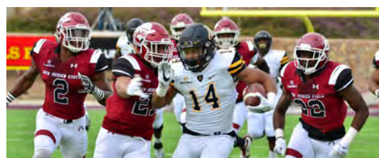
Out in Las Cruces, N.M., App State earned a share of its first FBS league title with a win at former Sun Belt foe New Mexico State.