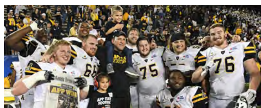
Thanks to a tiebreaking field goal with 5:41 left, App State won 31-28 against Toledo in a return trip to the Camellia Bowl.