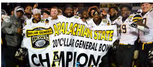
App State shut out high-scoring Toledo en route to a 34-0 victory in the Dollar General Bowl in Mobile, Ala.