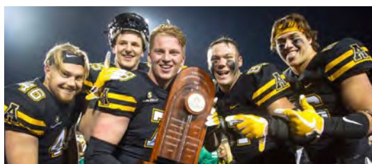
The Mountaineers clinched a Sun Belt title by closing the regular season with a 63-14 win against Louisiana on Senior Day.