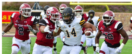
Out in Las Cruces, N.M., App State earned a share of its first FBS league title with a win at former Sun Belt foe New Mexico State.