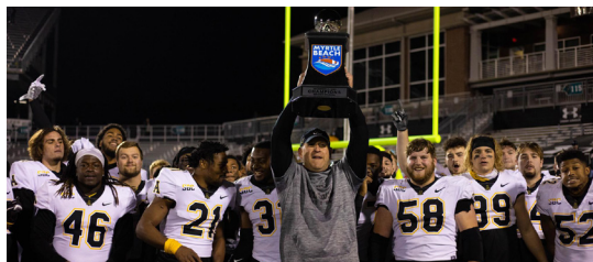
App State rushed for 500 yards in a 56-28 victory against North Texas in the first Myrtle Beach Bowl.