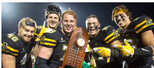
The Mountaineers clinched a Sun Belt title by closing the regular season with a 63-14 win against Louisiana on Senior Day.