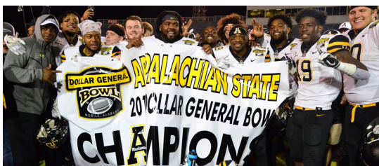
App State shut out high-scoring Toledo en route to a 34-0 victory in the Dollar General Bowl in Mobile, Ala.