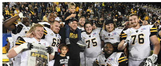
Thanks to a tiebreaking field goal with 5:41 left, App State won 31-28 against Toledo in a return trip to the Camellia Bowl.