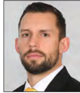
NICCARDWELL Offensive Line