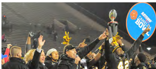
Making its FBS postseason debut, App State rallied from a 24-7 deficit and kicked a 23-yard field goal as time expired in a 31-29 win against Ohio in the Camellia Bowl in Montgomery, Ala.