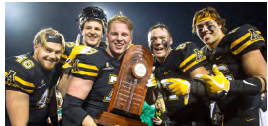
The Mountaineers clinched a Sun Belt title by closing the regular season with a 63-14 win against Louisiana on Senior Day.