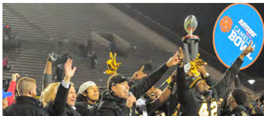
Making its FBS postseason debut, App State rallied from a 24-7 deficit and kicked a 23-yard field goal as time expired in a 31-29 win against Ohio in the Camellia Bowl in Montgomery, Ala.