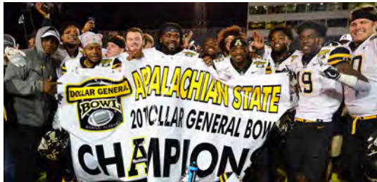
App State shut out high-scoring Toledo en route to a 34-0 victory in the Dollar General Bowl in Mobile, Ala.