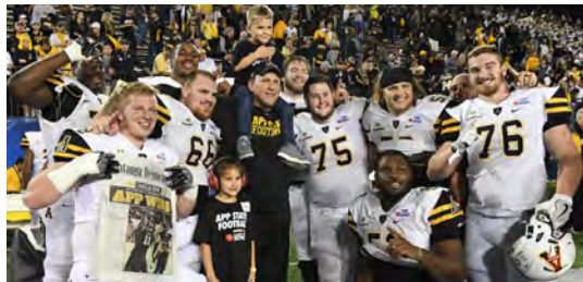
Thanks to a tiebreaking field goal with 5:41 left, App State won 31-28 against Toledo in a return trip to the Camellia Bowl.