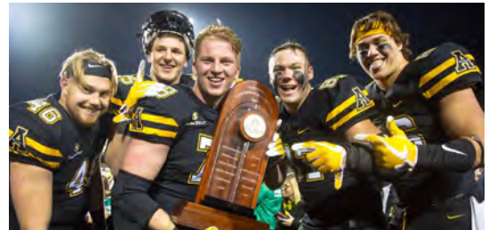
The Mountaineers clinched a Sun Belt title by closing the regular season with a 63-14 win against Louisiana on Senior Day.