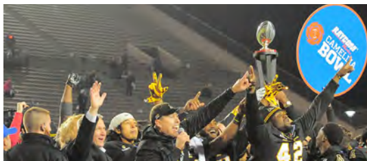
Making its FBS postseason debut, App State rallied from a 24-7 deficit and kicked a 23-yard field goal as time expired in a 31-29 win against Ohio in the Camellia Bowl in Montgomery, Ala.