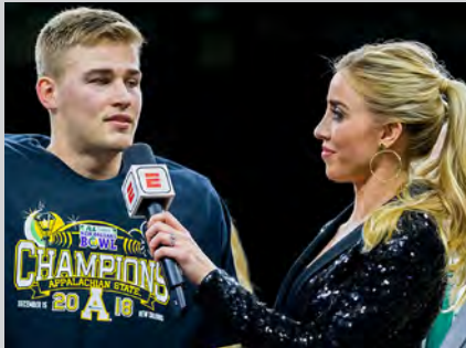
Coaches Predicted Champion App State