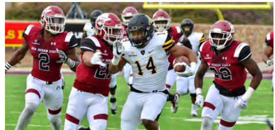
Out in Las Cruces, N.M., App State earned a share of its first FBS league title with a win at former Sun Belt foe New Mexico State.