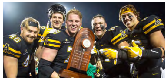
The Mountaineers clinched a Sun Belt title by closing the regular season with a 63-14 win against Louisiana on Senior Day.