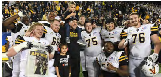
Thanks to a tiebreaking field goal with 5:41 left, App State won 31-28 against Toledo in a return trip to the Camellia Bowl.