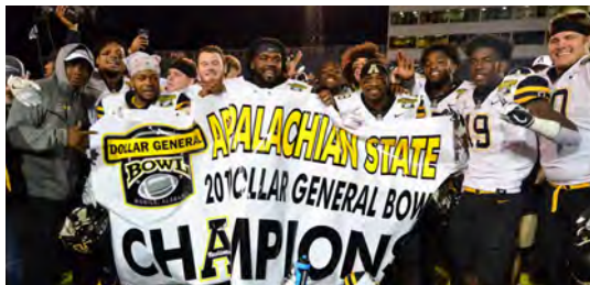
App State shut out high-scoring Toledo en route to a 34-0 victory in the Dollar General Bowl in Mobile, Ala.