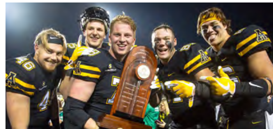
The Mountaineers clinched a Sun Belt title by closing the regular season with a 63-14 win against Louisiana on Senior Day.