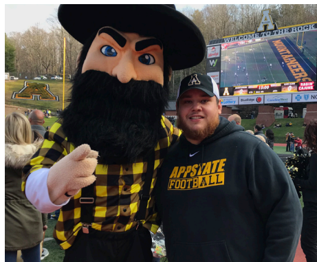
Country music star Luke Combs, who attended App State, poses with Yosef on the field during the 2017 home finale against Louisiana.