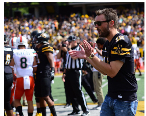
Country music star Eric Church, who also attended App State, participated in the pregame coin toss before the 2016 home game against Miami.