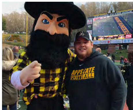
Country music star Luke Combs, who attended App State, poses with Yosef on the field during the 2017 home finale against Louisiana.