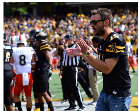
Country music star Eric Church, who also attended App State, participated in the pregame coin toss before the 2016 home game against Miami.