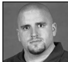
JEFF DILLMAN STRENGTH & CONDITIONING