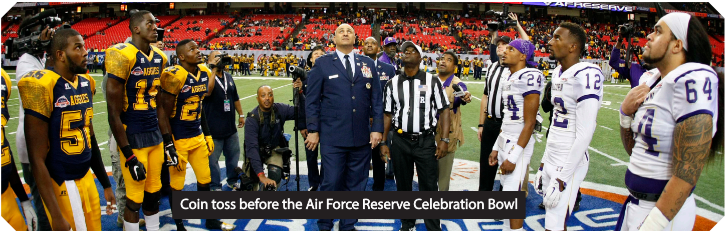
Coin toss before the Air Force Reserve Celebration Bowl

Celebration Bowl N.C. A&T 41 Alcorn State 34