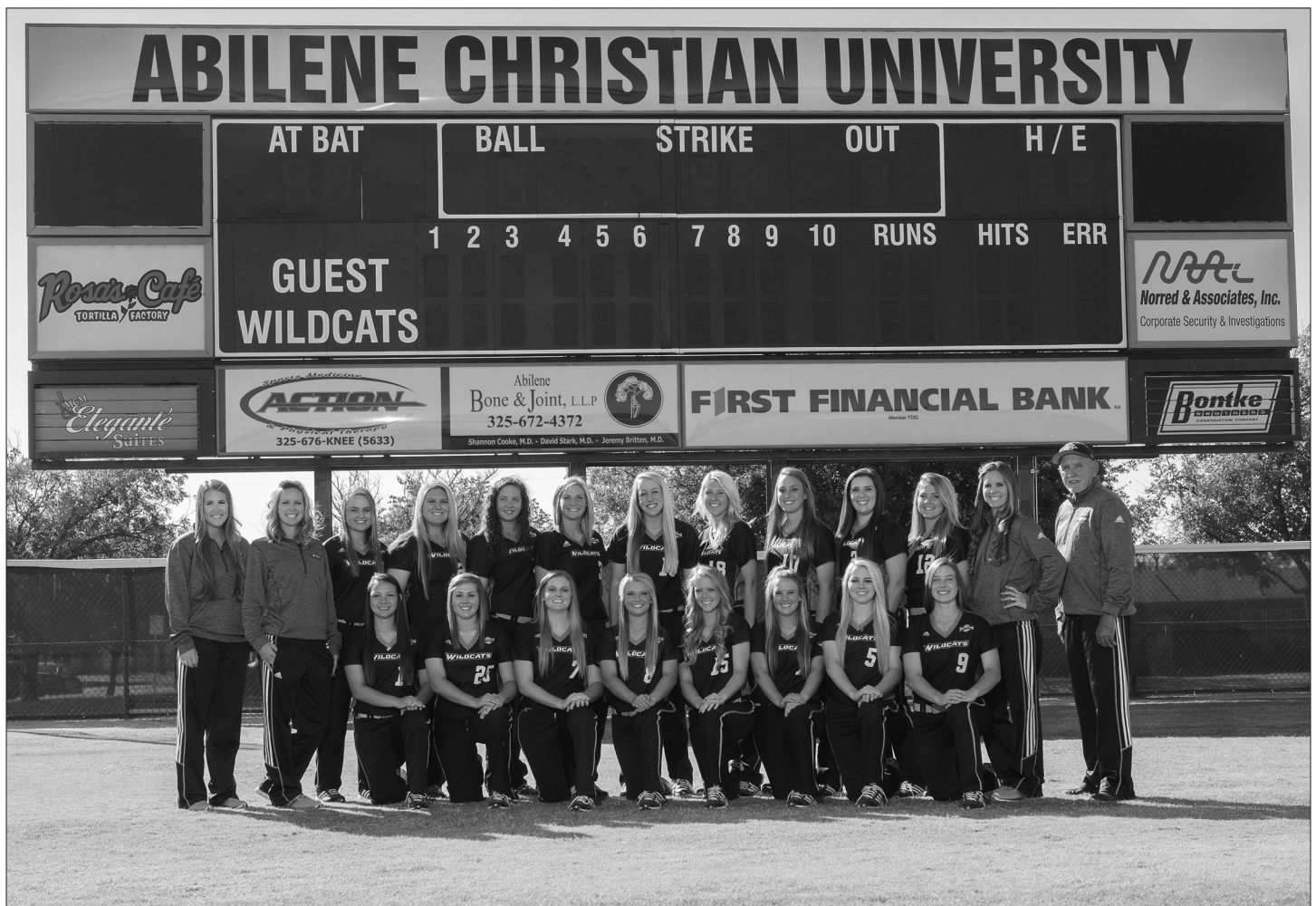
THE 2016 ABILENE CHRISTIAN WILDCATS