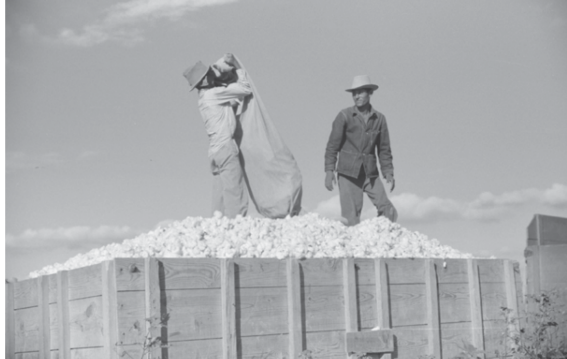
THIS PAGE: Marion Post Wolcott documented Latino farmworkers on Knowlton Plantation in Perthshire, MS, as part of her work for the Farm Security Administration in 1939. OPPOSITE: Chandra McCormick photographed prisoners at Angola, LA, on their way to work in the fields in 2004.