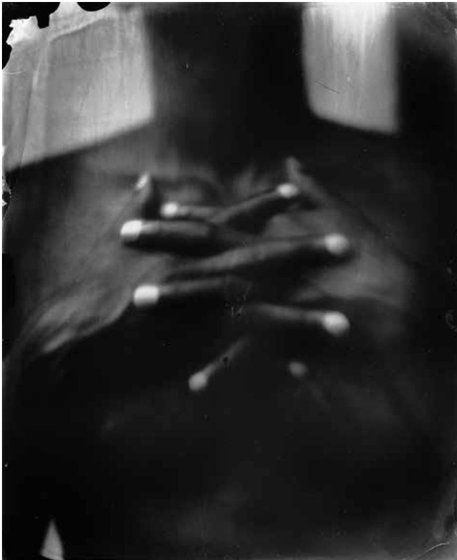
In her photographs that depict Black subjects, Sally Mann confronts mythologies that she, a white woman from the South, has long wrestled with in her work.

ANYONE WHO KNOWS THE SOUTH UNDERSTANDS THAT THE REGION exists beyond stock images of rusted red pickup trucks in cotton fields or white-columned antebellum mansions surrounded by moss-laden live oak trees. Yet these traditional and sometimes romanticized tableaux are difficult to escape. The very idea of regionalism in America may be in flux, yet in the South we cling to outdated ideas even while we seek to transcend them. The prevalence of folk traditions drives a Southern desire to maintain the way we see our image as well as the very idea of ourselves. And those same myths are at odds with the idea of a changing and evolving South many of us embrace.