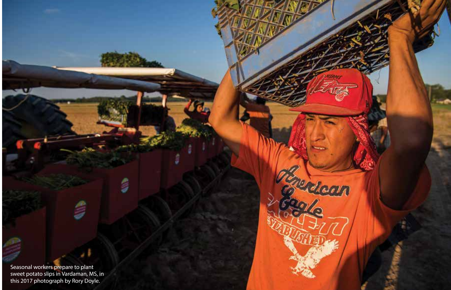
Seasonal workers prepare to plant sweet potato slips in Vardaman, MS

Changing the way we see the region, and changing our vision of the South,