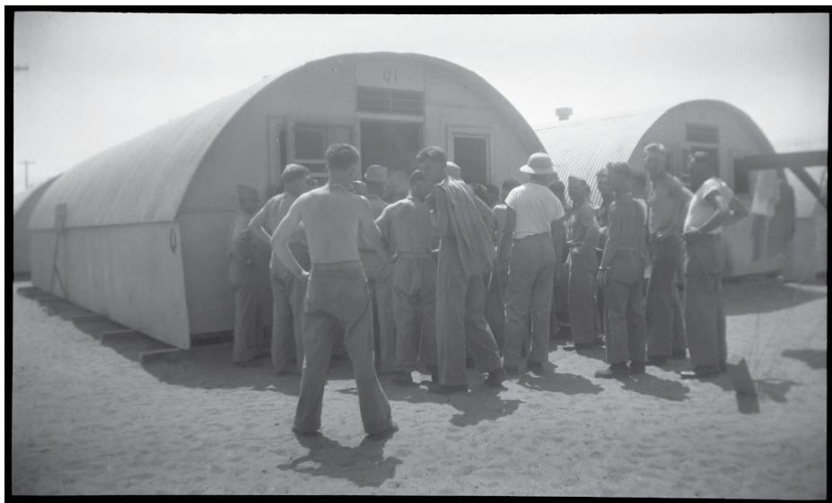
U.S. Marines outside a Quonset hut at Parris Island, SC, 1942