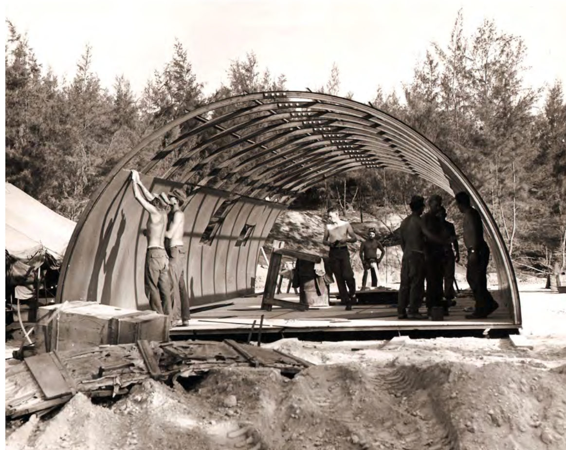
U.S. Navy Seabees assemble a Quonset hut at Chu Lai, Vietnam, 1966.