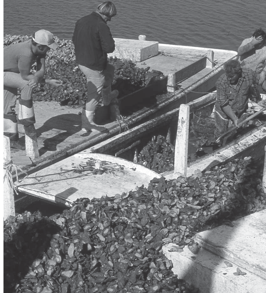
Oystermen on the Eastern Shore of Virginia, ca. 1975.

Cultural sustainability on Virginia’s Eastern Shore