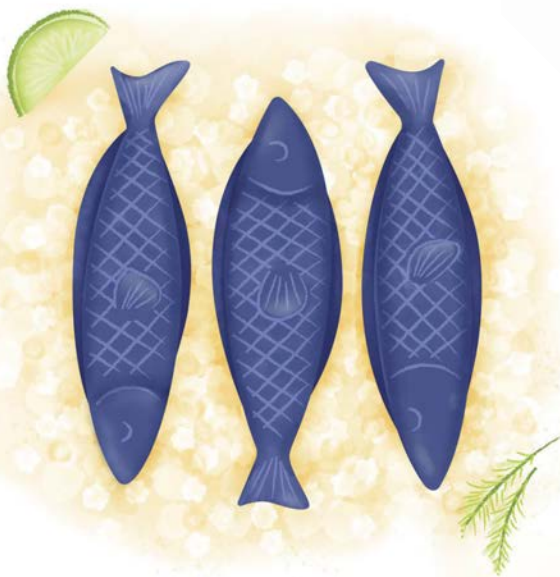
Illustrations by Bridgette Blanton / Tiny Pencil Studio

A friend of mine owns a vacation rental on Cross Lake, outside of the city. It's affordable, cute—all of those great things you look for in a rental. And there's freshwater fishing right there. You don't hear anything but what's on the water. They have fishing poles. You can go outside in your pajamas and fish, then come back inside and fry it.