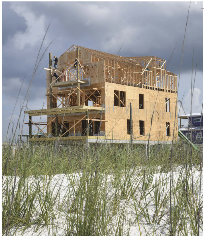
LEFT: A sign welcomes visitors to Mexico Beach.