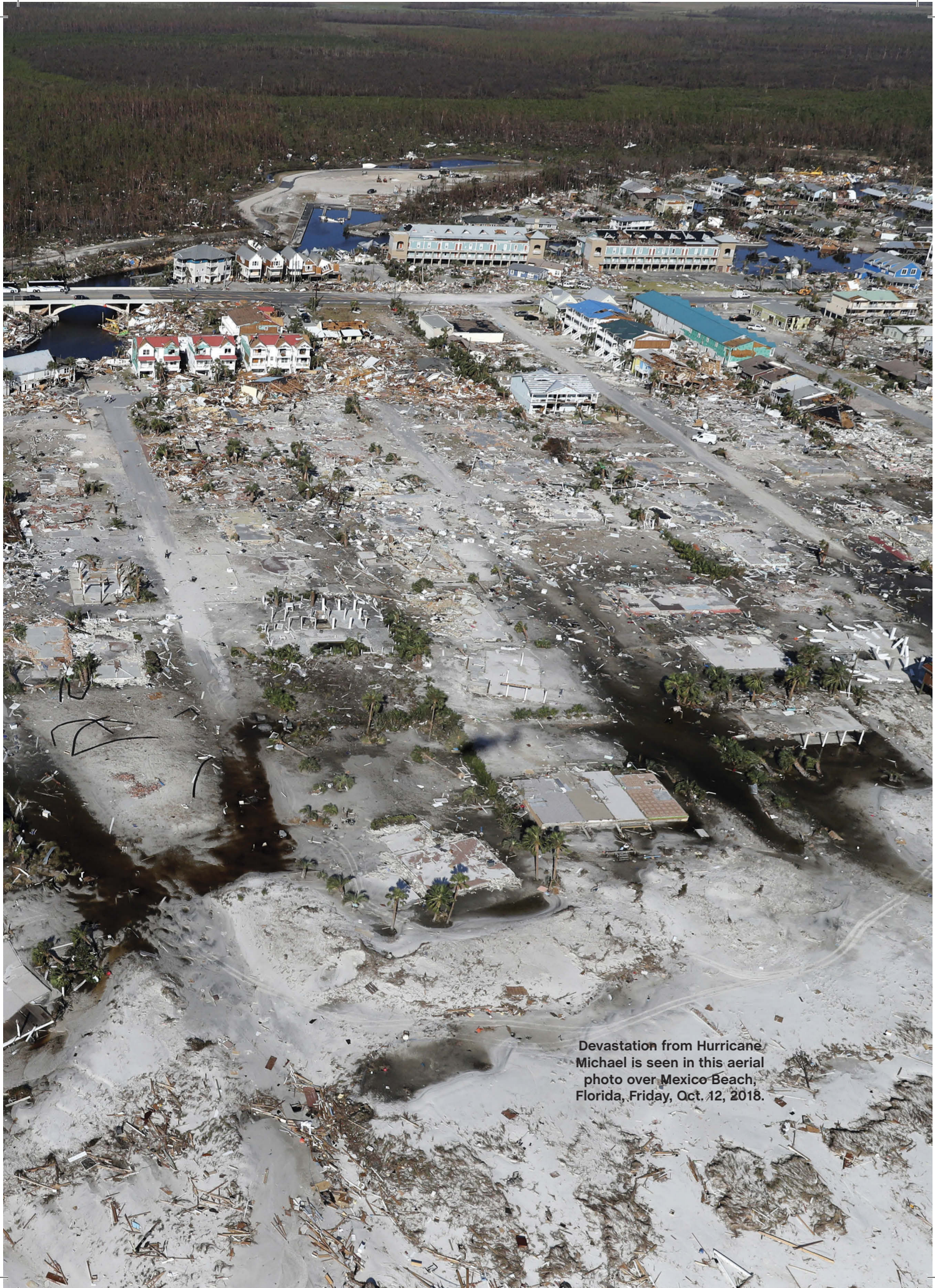
Devastation from Hurricane Michael is seen in this aerial photo over Mexico Beach, Florida, Friday, Oct. 12, 2018.