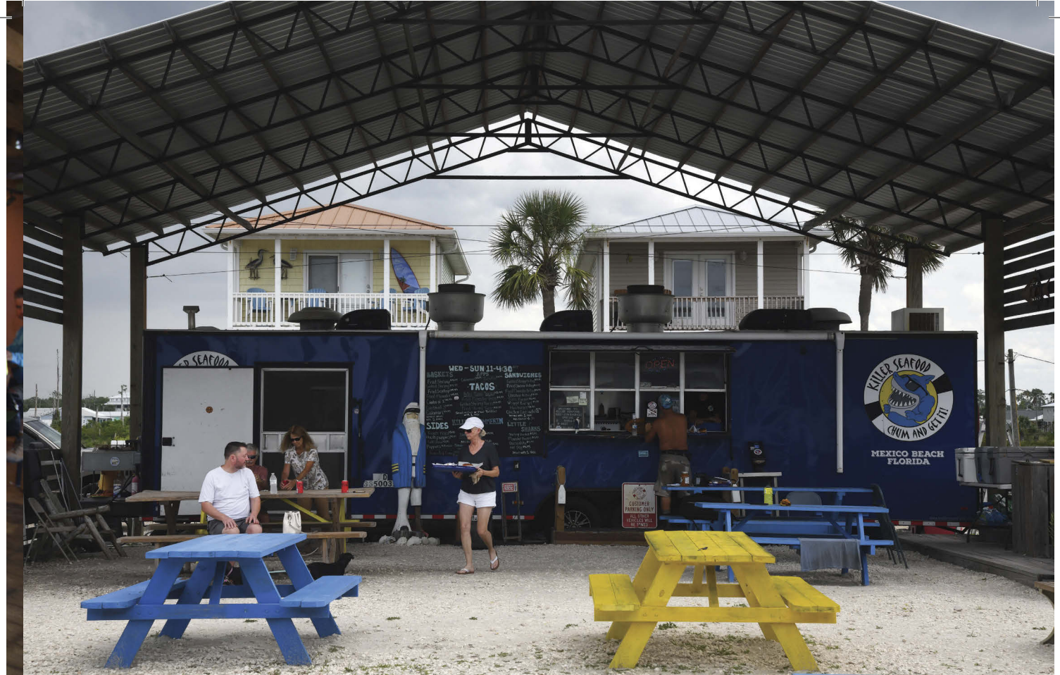
Patrons enjoy lunch at Killer Seafood in Mexico Beach, May 2023.