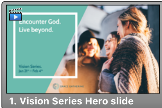
1. Vision Series Hero slide