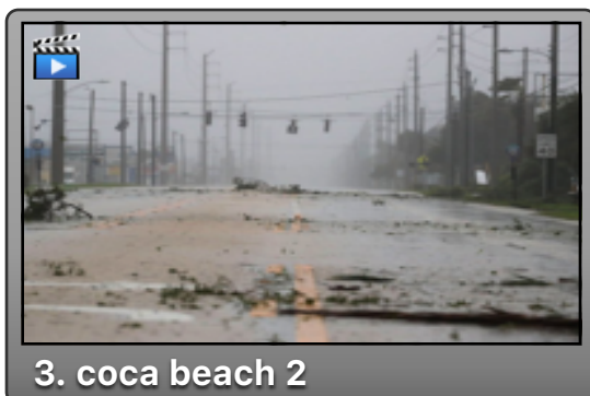
3. coca beach 2