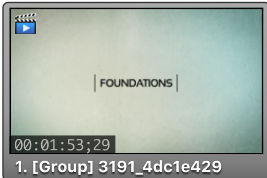
1. [Group] 3191_4dc1e429