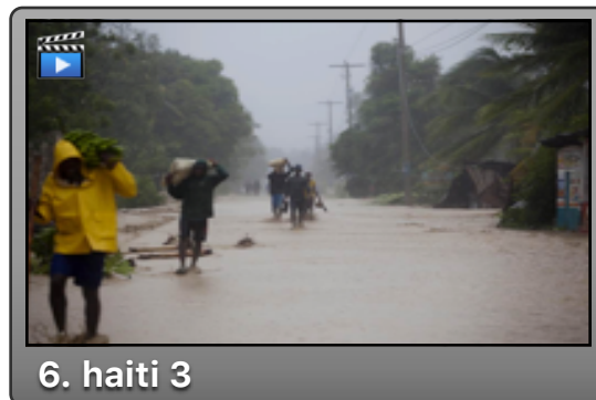
6. haiti 3