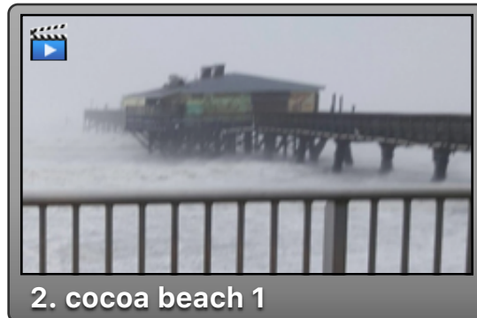
2. cocoa beach 1