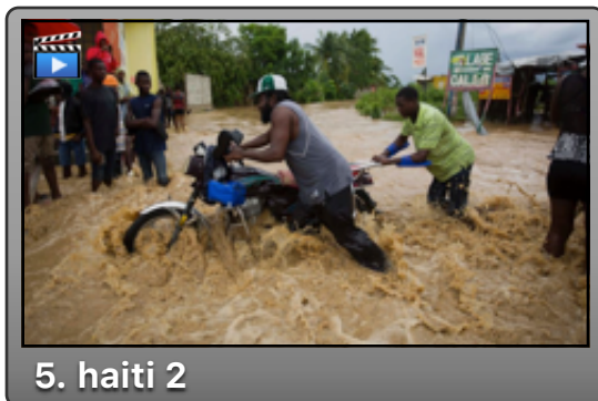
5. haiti 2