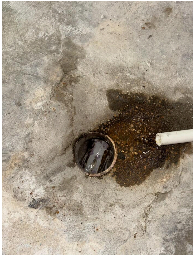
Basement sewer opening.