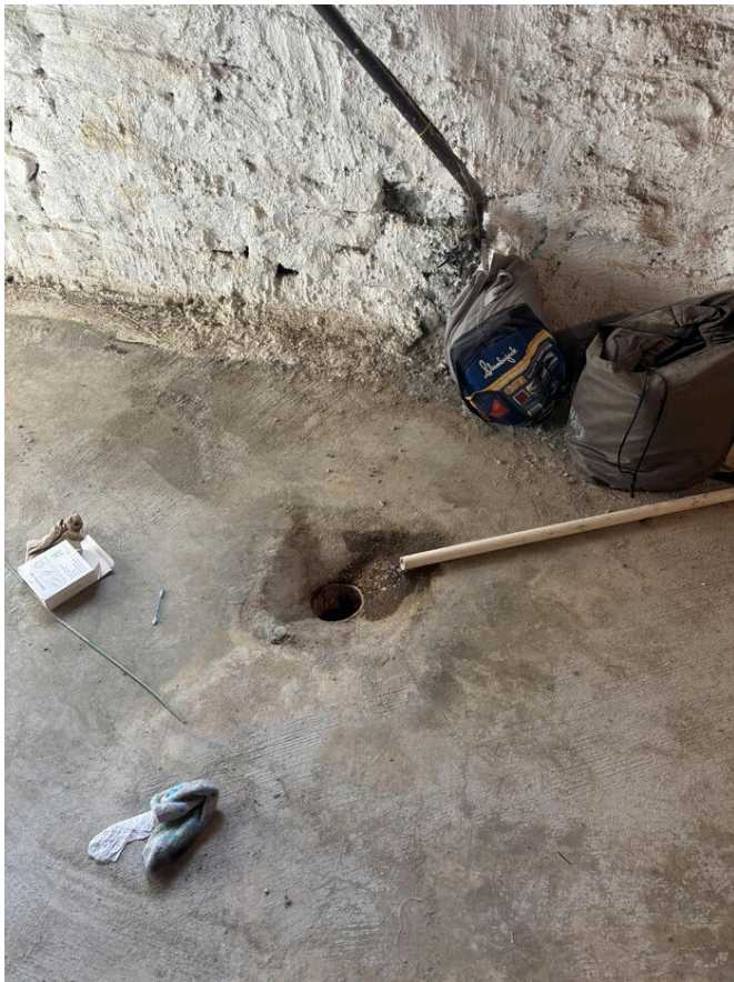
Basement sewer opening.

Successful access was achieved through the exterior vent/clean out. Observation of debris buildup within the sewer lateral line after the exterior P-trap. Would recommend having debris cleaned out and the sewer line further inspected to ensure debris was properly cleared and to check condition of the sewer pipe at this location. We also observed a basement sewer opening without a P-trap. This may allow sewer gasses/smells into the home. Would recommend having this further evaluated and corrected as necessary by a qualified plumbing professional.