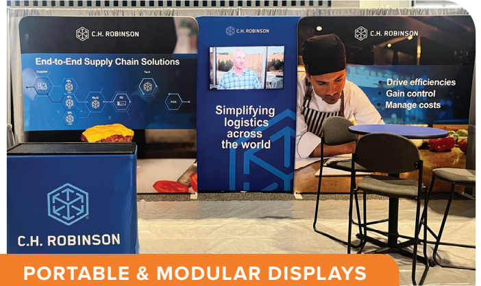
PORTABLE & MODULAR DISPLAYS