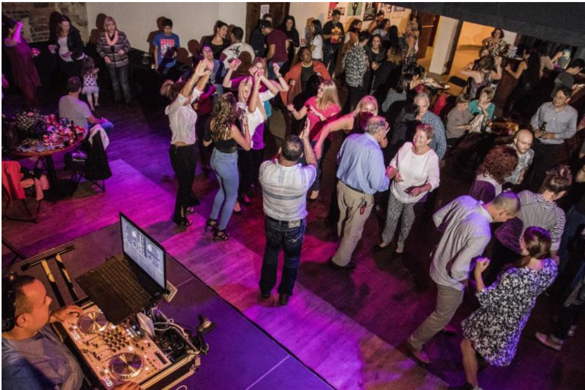
DJ and dance party at iCELEBRANDO THREE YEARS! (2016).