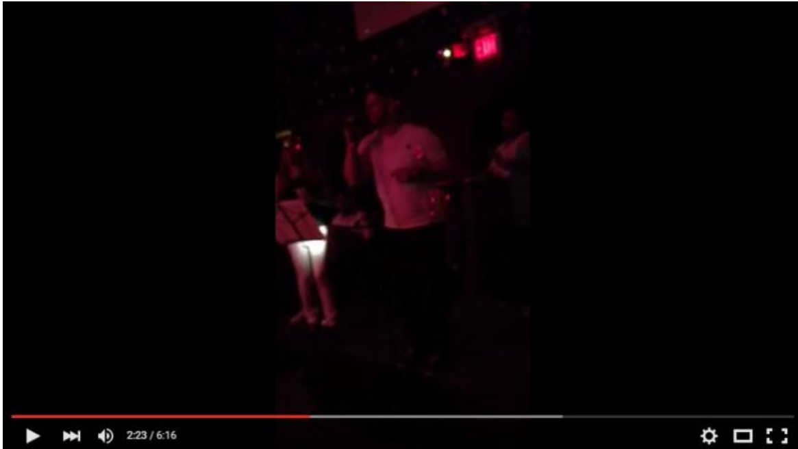
10/22 Mambo Caliente

And come early for live music before the show... here's who's playing!