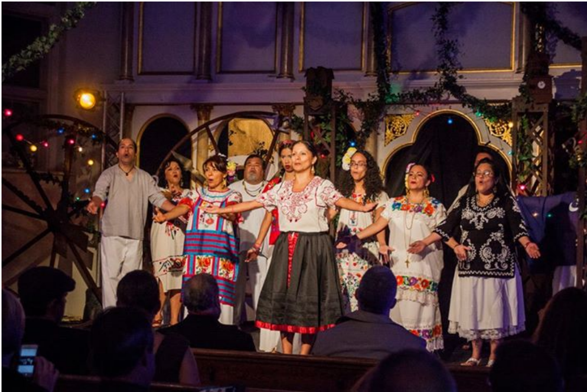
A sneak peek of ¿Dónde Está My Home? (Where is Mi Hogar) at Pandemonium 2015: Transform!