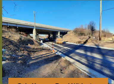
Bale Kenyon Road Widening