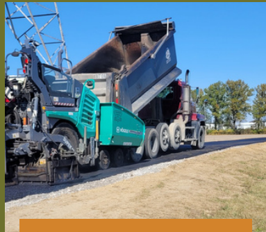
Green Meadows Trail Extension