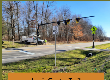
Lewis Center Trail

A new year brings the opportunity to reflect on our accomplishments and plan for the future. When I was sworn-in as trustee, I said I wanted to focus on expanding our trail network and stretching our tax dollars. In 2023, the multi-use trail was extended and a rapid flashing beacon was installed along Lewis Center Road to provide greater access to Alum Creek State Park. When the multi-use path is completed down Bale Kenyon Road after its widening, much of the Township will be able to bike over to the Ohio to Erie Trail from their neighborhood. We are diligently working towards the day when we can connect the entire Township. The Township also formed a joint economic development district in 2023. A JEDD will allow the Township to recover some of the costs for providing services to new commercial developments so that residents are not paying for increasing demands for services. We have much for which to be thankful and the future is bright. I am excited to see what we accomplish as a community in the year ahead.