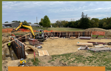
Veterans Memorial Construction