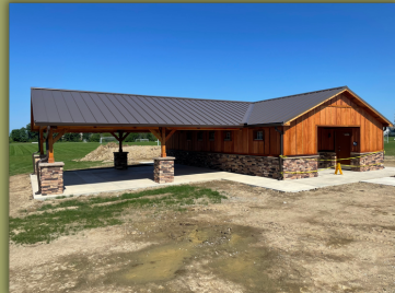
North Road Park Shelter House