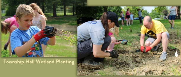
Township Hall Wetland Planting