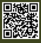
Foot Golf/Disc Golf Course Map