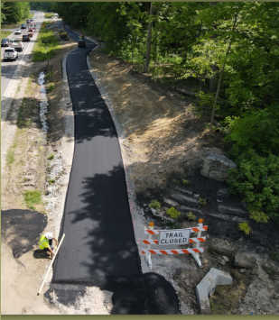
Lewis Center Trail-Phase 3