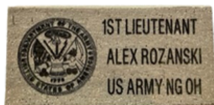
4"x2" Engraved Paver