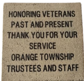
8"x8" Engraved Paver

The Orange Township Veterans Memorial continues to move forward. We received two significant anonymous donations last year, and we also obtained grant money from the State of Ohio! To further assist in funding the memorial, we are now selling commemorative bricks on the Orange Township website that will allow individuals and families to memorialize their loved one's military service. Prices start at $25 and go all the way up to $350 for the largest available options. The impact of inflation continues to challenge this project and many others that are still in process. We will continue to raise funds and seek donations in hopes we can construct the designed memorial without revisions. Thank you all for your generous support to date!