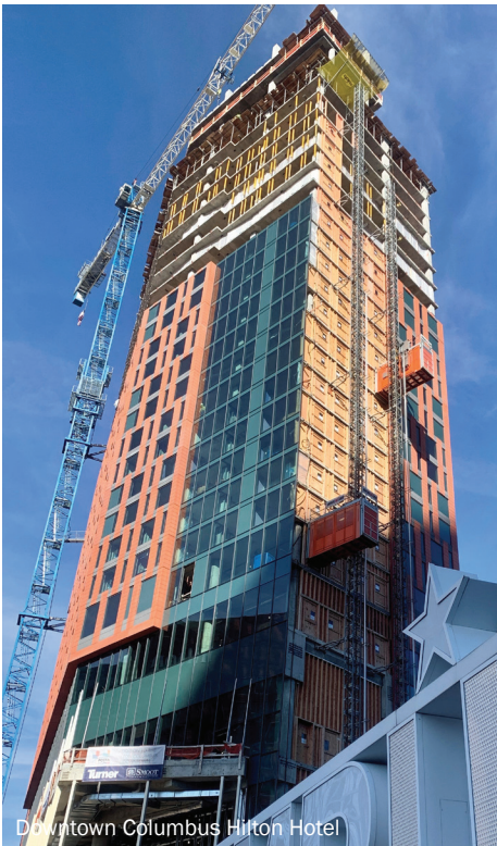
Downtown Columbus Hilton Hotel