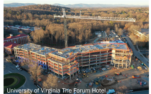
University of Virginia The Forum Hotel