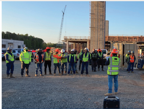
Superintendent/ Field Manager