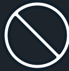
Trespassing & Intruders