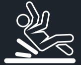
Property Damage & Liability