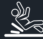
Site Accidents & Liabilities