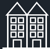
Manage Building Activity