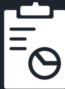
Document and Time Stamp Entry and Exit Traffic

Stealth offers remote gate and integrated access control solutions for shopping centers, apartment buildings, transportation & logistics centers, warehouses, retailers, construction sites, office buildings and storage facilities.