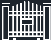
Gate Access Control